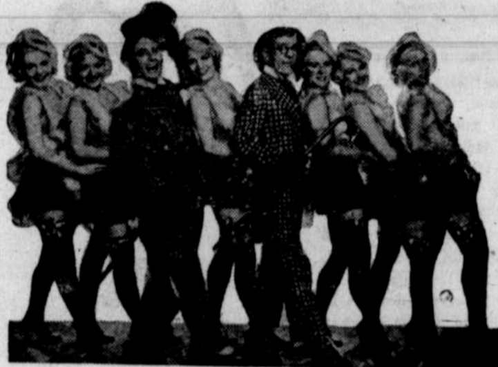
Bert Wheeler and Robert Woolsey in one of the smart song and dance ensemble numbers in "Diplomaniacs" their new RKO-Radio musical comedy disturbance which fetches merriment to a new high on the screen.

Wheeler and Woolsey in "Diplomaniacs" at Liberty Theatre Tonight—"Mama Loves Papa" Coming Sunday