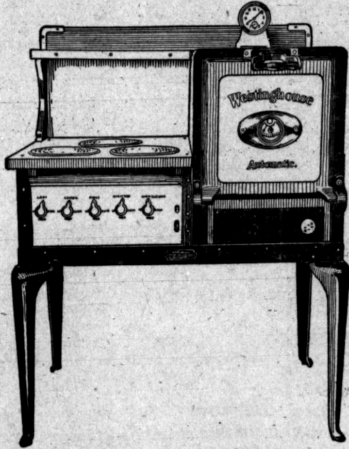
"WESTINGHOUSE IN EVERY HOUSE"

THE MOST LIBERAL OF- FER EVER MADE ON THE WESTINGHOUSE ELECTRIC RANGES