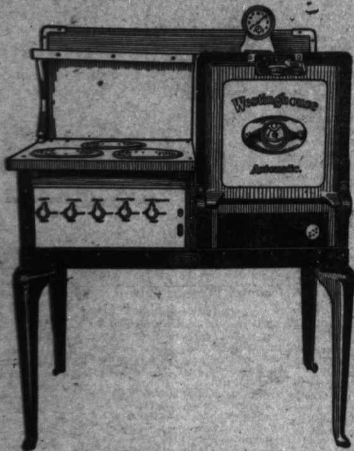
"WESTINGHOUSE IN EVERY HOUSE"

THE MOST LIBERAL OF- FER EVER MADE ON THE WESTINGHOUSE ELECTRIC RANGES