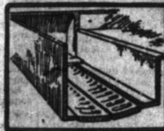
THE WIDE AND SHALLOW FIREBOX