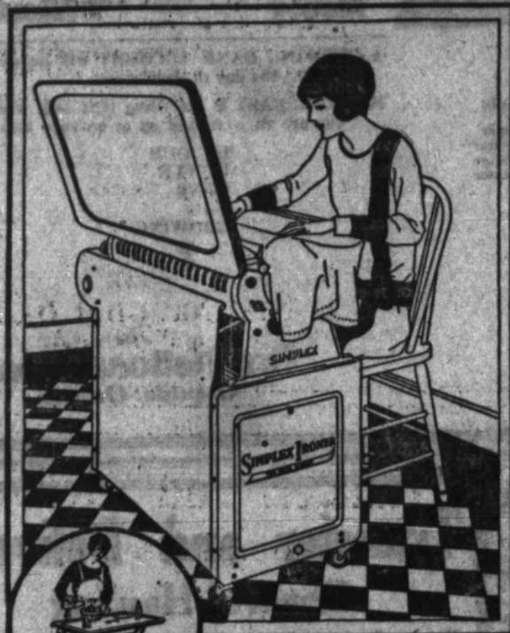
The illustration above shows the Junior Simplex with table top raised ready for ironing. The illustration at the left shows one of the many uses of the table top.