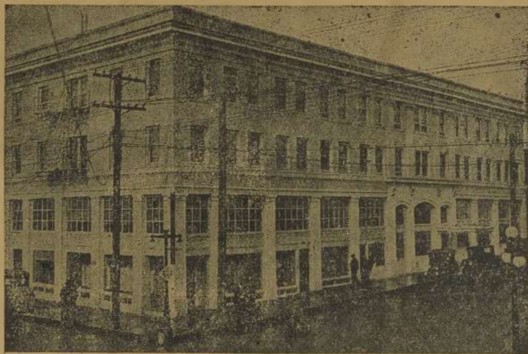
COQUILLE'S MODERN, FIREPROOF, $80,000 HOTEL