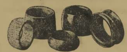
MYRTLEWOOD NAPKIN RINGS

Myrtlewood, a native wood, which nowhere else in the known world has attained a growth sufficient to make it a commercial wood other than in Coos, Curry and Douglas counties,