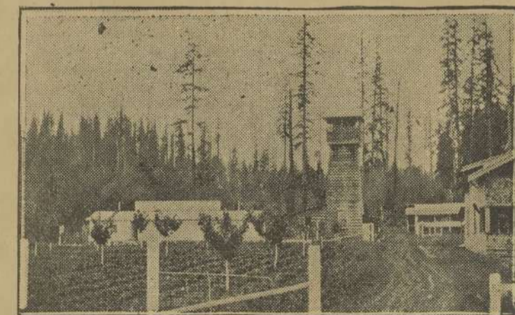
CAKLETON CHICKEN RANCH AT FAIRVIEW