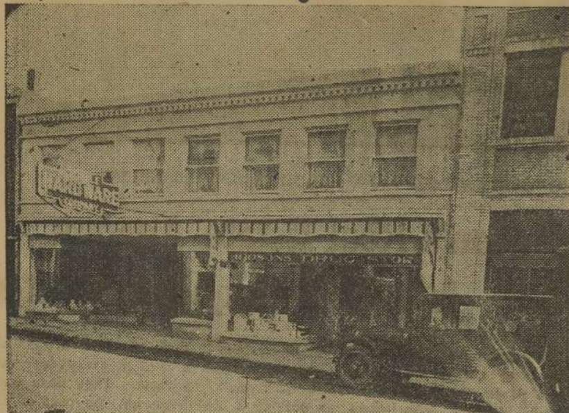
ELLINGSON BUILDING RECENTLY PURCHASED BY COQUILLE HARDWARE CO. OCCUPIED BY THEM AND HUDSON DRUG STORE