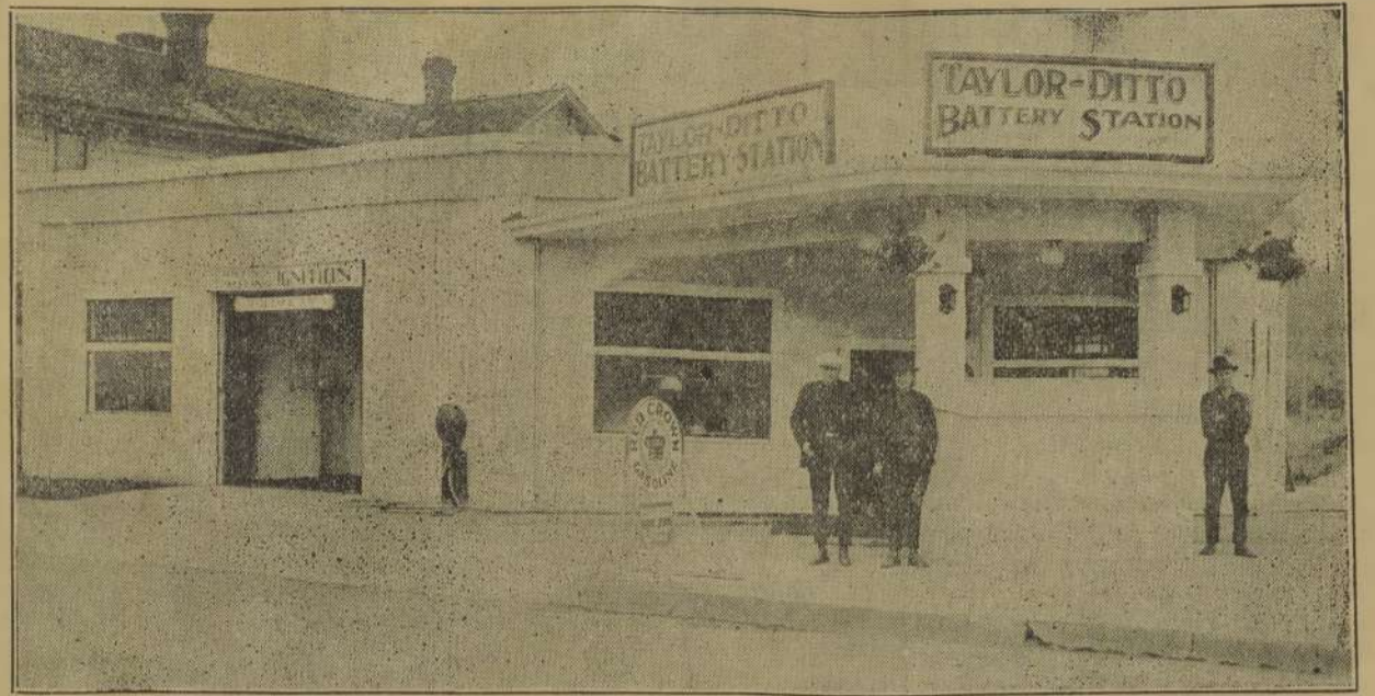
TAYLOR-DITTO BATTERY STATION—ONE OF COQUILLE'S POPULAR SERVICE STATIONS