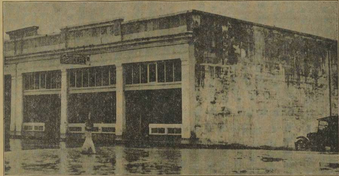
THE "BUSY CORNER GROCERY" OF THE COQUILLE VALLEY MERCANTILE CO.

In citing the organizations and establishments that stand out as features illustrative of the progress made and being made in this city, we do not hesitate to point to the establishment located at the corner of Front and Willard Streets known under the trade name of the Busy Corner, which has been the location for the store for the past nine years.