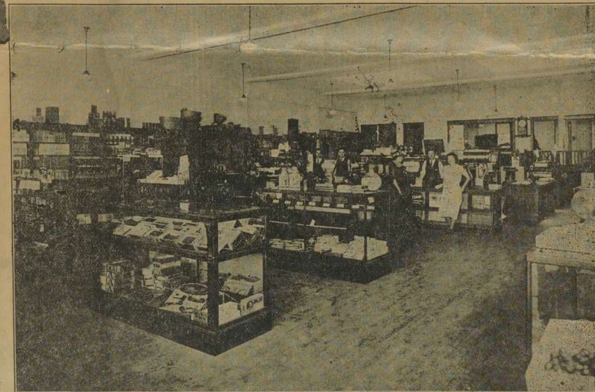
INTERIOR OF THE BUSY CORNER SAID TO BE THE MOST CONVENIENTLY ARRANGED GROCERY IN OREGON

It is with pride we are enabled to refer to this Coquille establishment as the largest and most important business establishment covering its line in the county in our Anniversary number, and in recognizing this great success full credit must be given to the judgment and integrity of the owners of this corporation, and par-