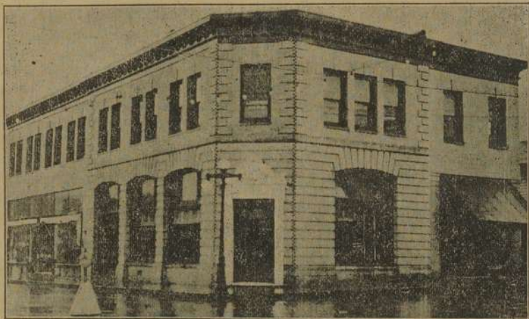
FIRST NATIONAL BANK BUILDING--ERECTED IN 1910

The bank maintains a safe deposit department where safe deposit boxes