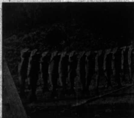
A SINGLE DAY'S CATCH IN COOS COUNTY'S STREAMS

solutely fireproof building built in 1916 and 1917. It contains the offices of the county clerk, the county treasurer, the sheriff and tax collector and the county jail is on the top floor.