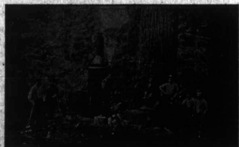
A LOGGING CAMP SCENE IN COOS COUNTY.

In the matter of transportation Coquille is most fortunately served by the Coast Auto Lines, which radiate out of Coquille in every direction connecting Coquille with all of the surrounding country and affording two major connections with the north and south coast highway service and direct connection with California via Crescent City.