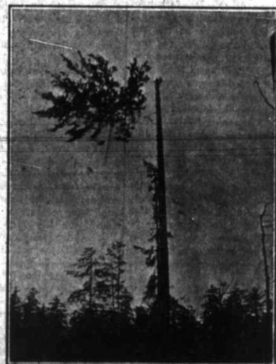
HIGH CLIMBER TOPPING FIR FOR HIGH LINE SPAR TREE