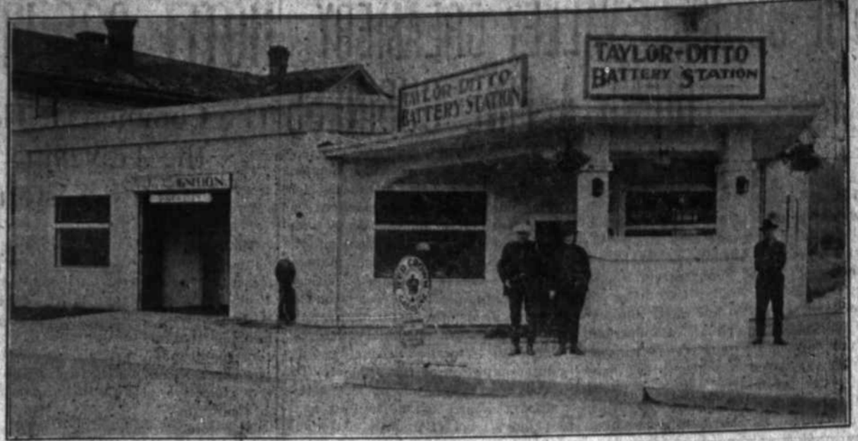
TAYLOR-DITTO BATTERY STATION—ONE OF COQUILLE'S POPULAR SERVICE STATIONS

Added to this our climate—never too warm and seldom cold enough for frost—is an added attraction to the tourist, and invites him to linger amid enchanting scenes and enjoy them without alloy.