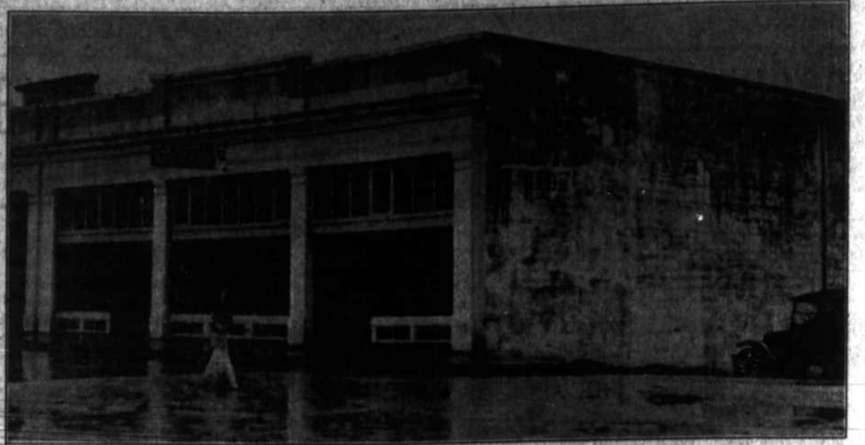
THE "BUSY CORNER GROCERY" OF THE COQUILLE VALLEY MERCANTILE CO.

In citing the organizations and establishments that stand out as features illustrative of the progress made and being made in this city, we do not hesitate to point to the establishment located at the corner of Front and Willard Streets known under the trade name of the Busy Corner, which has been the location for the store for the past nine years.