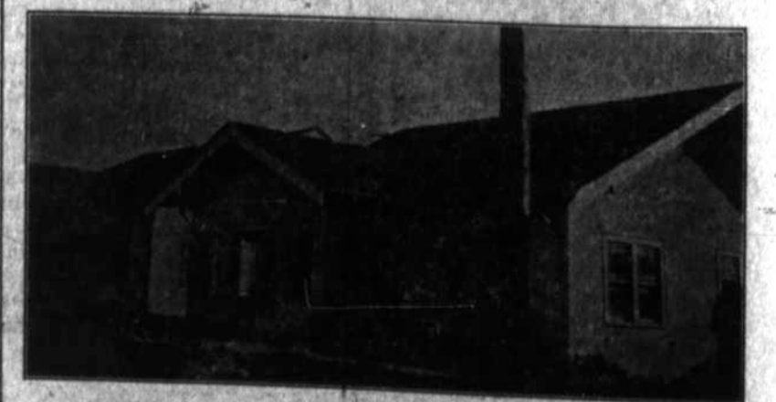
TWO NEW BUNGALOWS BUILT BY E. W. GREGG LAST YEAR

Without exception they are all preparing for a larger business this year.