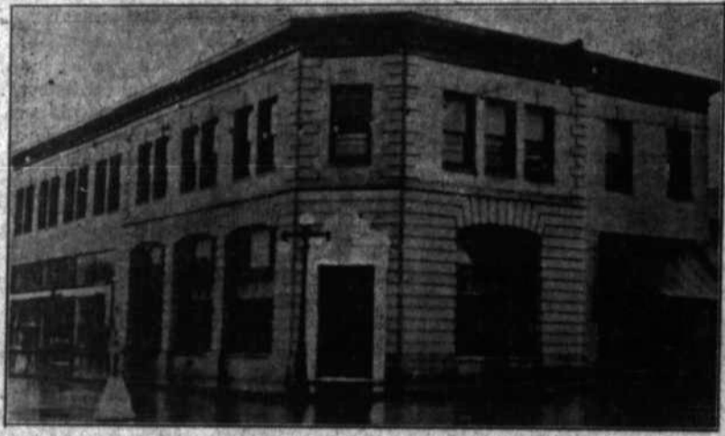
FIRST NATIONAL BANK BUILDING—ERECTED IN 1910

The bank maintains a safe deposit department where safe deposit boxes