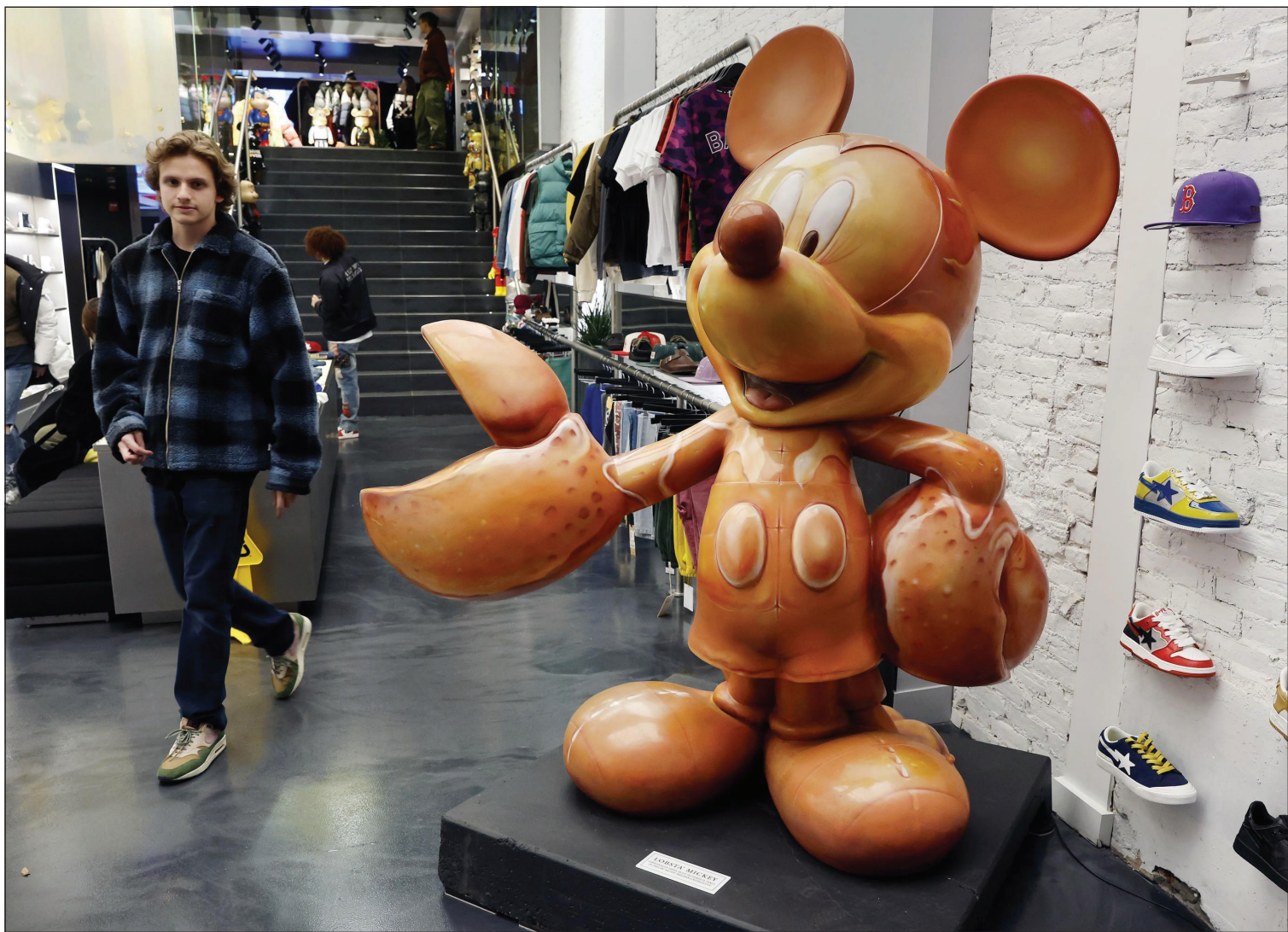
"Lobsta Mickey" is displayed in the Concepts sneaker store, Friday, Nov. 25, 2022, in Boston. The 700-pound, long-forgotten statue of Mickey Mouse with giant lobster claws for hands has found its way back to Boston.