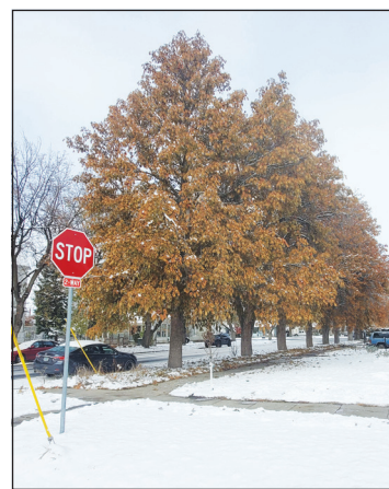
A line of trees along Second Street in Baker City still held most of their leaves on Tuesday, Nov. 29, 2022.