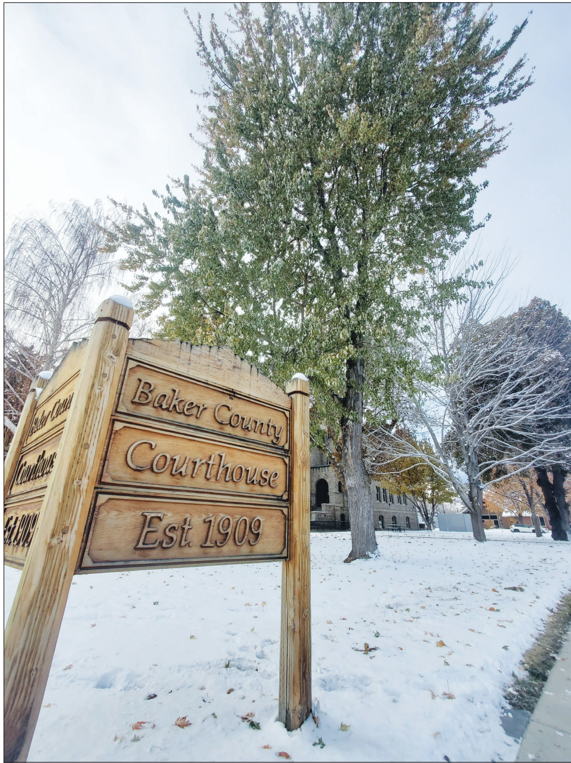
A leaf-laden tree on the east side of the Baker County Courthouse on Tuesday, Nov. 29, 2022.

The space below is for a postage label for issues that are mailed.