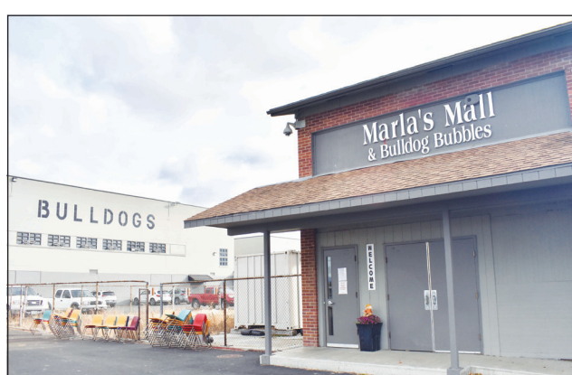
Marla's Mall is now located just west of Baker High School.