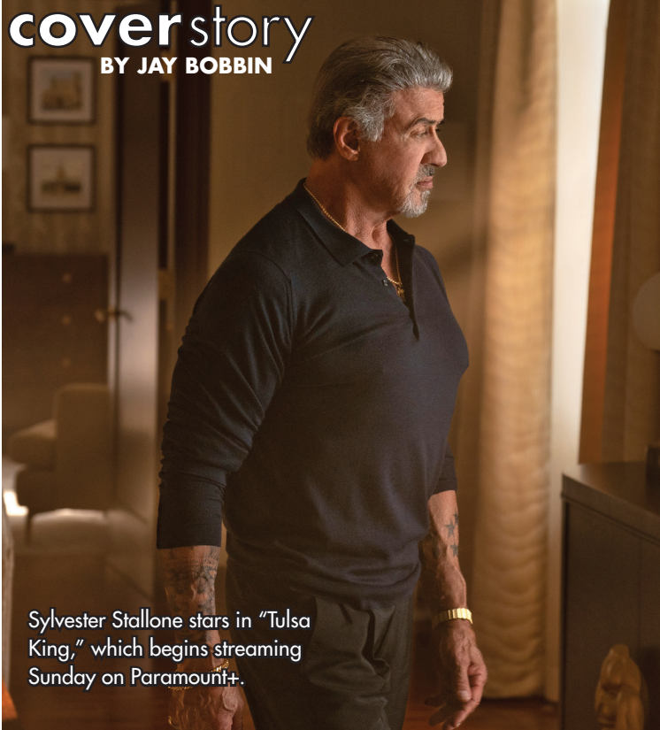
Sylvester Stallone stars in "Tulsa King," which begins streaming Sunday on Paramount+.