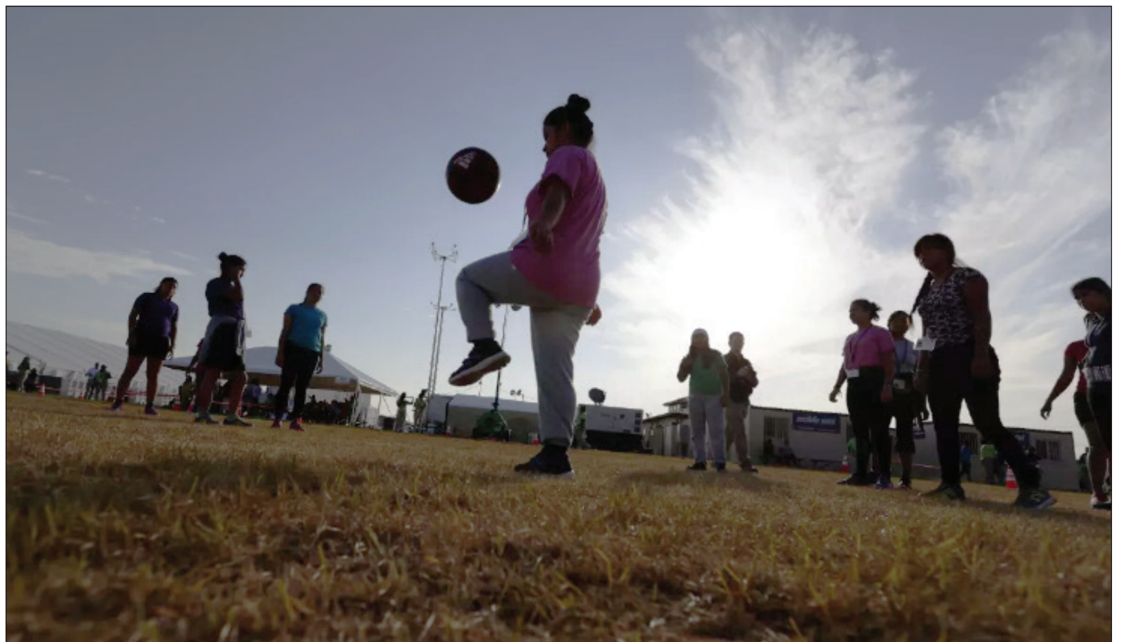
In this July 9, 2019, photo, immigrants play soccer at the U.S. government’s newest holding center for migrant children in Carrizo Springs, Texas. The U.S. government is taking new steps to ensure access to abortion services for pregnant migrant youths who are not accompanied by parents by assigning them to shelters in states that still allow abortion.

The refugee office is part of the Health and Human Services Department and is responsible for oversight of migrant children who are found traveling alone.