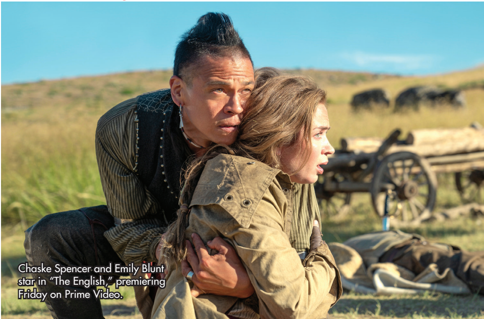
Chaske Spencer and Emily Blunt star in "The English," premiering Friday on Prime Video.

A woman's quest to avenge her son's death launches her into an epic adventure across a violent 1890s landscape in a Western series coming to Prime Video.