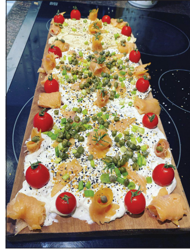
Butter boards, the polarizing stepchild of charcuterie, have taken TikTok to new food-craze heights.

with Vegetables." "I think the draw is that it's super customizable," Doiron told The Associated Press. "You can be so creative with it, and people are always looking for something they've never seen before. It's a low effort way to have some fun with food." Side note: She has a plant named Butter. Doiron went viral with her busy butter board and hand swipes with thick, crusty slices of bread. Copycat videos under the #butterboard hashtag have since racked up more than 240 million views on TikTok. Searches related to the topic have reached 10 billion on the platform, with decorated mountains of butter also going strong on Instagram. And the boards themselves have spawned sweet sister versions, vegan cousins and ice cream aunts and uncles. Magnolia Bakery posted a video of buttercream frosting being spread artfully on a cake stand with pieces of cookie, brownies, rainbow sprinkles and other goodies for swiping. Private chefs are fielding lots of requests from clients now looking for spreadables on boards. Kevin Hart's Los Angeles chef, Kai Chase, said she created several of the boards for him as