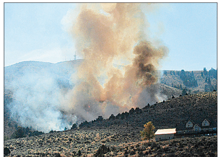
A fire burned about 130 acres on the foothill just southwest of Baker City on Oct. 6, 2022. The human-caused fire is still under investigation.