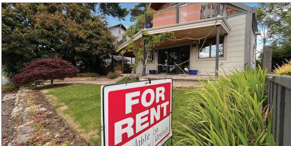
Renter protections from Oregon's pandemic-era emergency rent assistance program expired Friday, Sept. 30, 2022, eliminating the last renter safety net policies tied to the economic fallout from COVID-19.