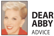
DEAR ABBY ADVICE

and declared, "This conversation is over."