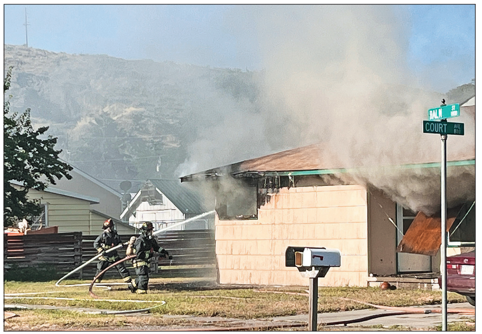
Baker City firefighters douse the burning home at 1895 Balm St. on Tuesday morning, Aug. 30, 2022.

He said it was fortunate that the fire hadn't spread into the entire attic before firefighters arrived. Had that