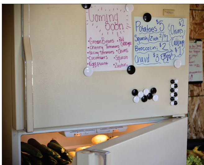
The fridge in the Happy Walrus Farm Stand in Imbler is filled with zucchini, squash, beets and more on Friday, Aug. 26, 2022.