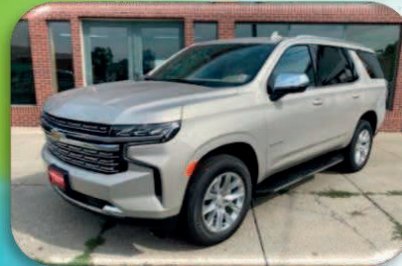
2022 Chevrolet Tahoe PREMIER DIESEL $71,415.00