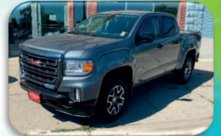
2022 GMC Canyon AT4 CREW CAB $44,065.00