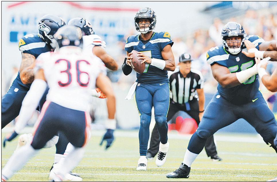
Seattle Seahawks quarterback Geno Smith drops back to pass during the second quarter against the Chicago Bears on Thursday, Aug. 18, 2022, at Lumen Field in Seattle.

Smith finished 10 of 18 for 112 yards and was hampered