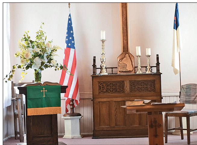
Above: The North Powder Community United Methodist church, shown here on Sunday, Aug. 14, 2022, was built in 1883. Below: This is a portion of the sanctuary of the North Powder Community United Methodist Church as it appeared on Sunday, Aug. 14, 2022.