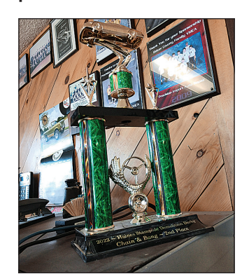
The derby trophy resides on O'Dell's desk at Precision Import

tubing you might more expect to connect to a fire hydrant. Even then, it's against the rules to bash in the driver's door in derbies entirely.