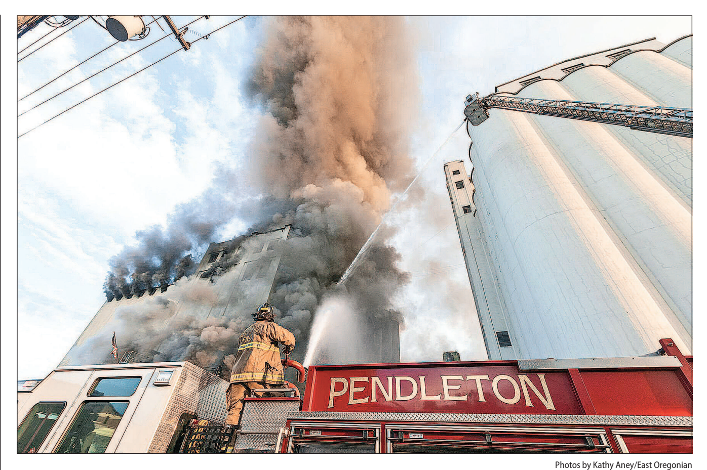
Smoke pours from the Pendleton Flour Mills on the morning of Wednesday, August 10, 2022 as firefighters work to control the blaze.

"I like to put a little humor with my announcing and choose to make fun of some of the things that are happening in our country," he said. "I understand that some of the people in this world cannot take a joke and they want every event or concert to only say what they believe. I don't think every comedian is hilarious and I don't like the food at every restaurant. But I don't waste my time complaining about it or trying to cancel someone. But that is the beauty of our country. Everyone has freedom of speech. It is enshrined in the First Amendment of the Constitution. It's called an opinion. And thank God we can have an opinion in the United States of America, because there are a lot of countries that don't allow you that privilege. I will continue to stand up for the red, white and blue, our military, first-responders and the greatest country in the world, the United States of America. Sorry if it offends you and have a great day."