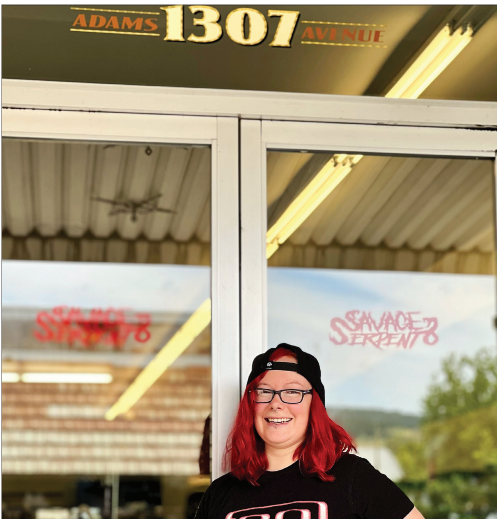
Shannon Golden/The Observer