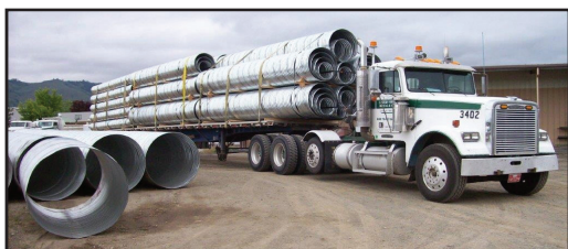
Pipe and Geotextiles