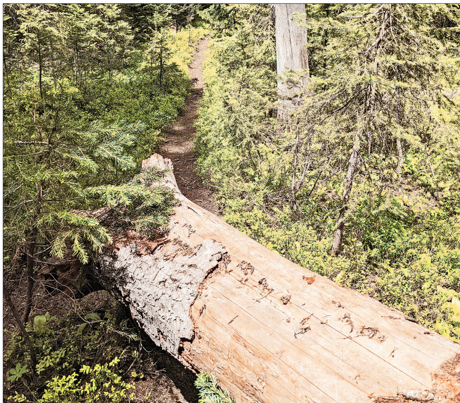
A large log lies across the Baldy Creek trail in the North Fork John Day Wilderness southwest of Anthony Lakes.