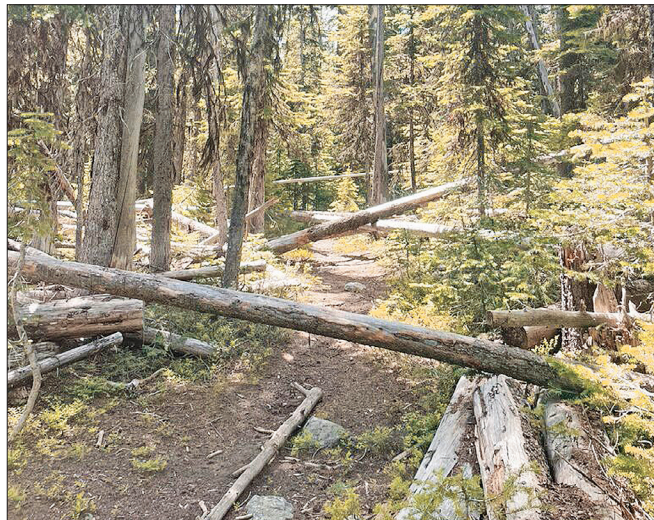
LEFT: Multiple logs across the Killamacue Lake trail in the Elkhorn Mountains prior to the trail being cleared by staff with the Trailhead Stewardship Project in early July 2022. RIGHT: A freshly cut log along the Killamacue Lake trail in the Elkhorn Mountains west of Haines.