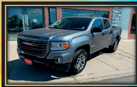
2022 GMC Canyon AT4 $44,890.00