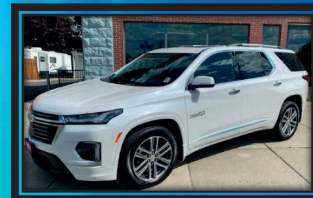
2022 Chevrolet Traverse High Country $56,265.00