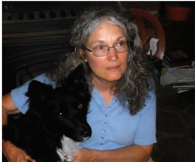
The “Sue Orlaske Retrospective” exhibit at Art Center East will honor the late Sue Orlaske.