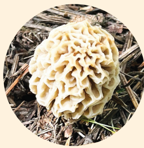
White morels are easily spotted against a background of conifer needles and wild strawberry plants.