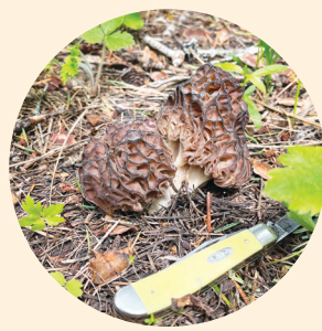
Black morels fill your bag quickly when you find two large ones together