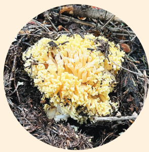
Coral mushrooms grow up to a pound or more in size and are best harvested when they first push up through damp soil.