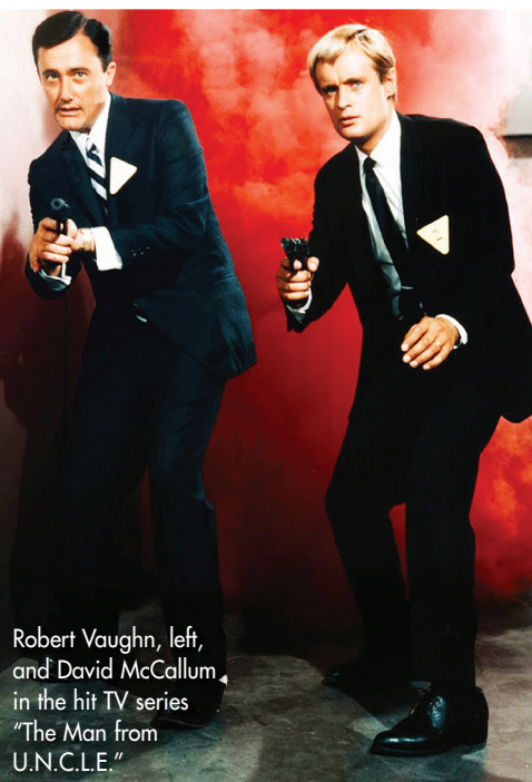
Robert Vaughn, left, and David McCallum in the hit TV series "The Man from U.N.C.L.E."