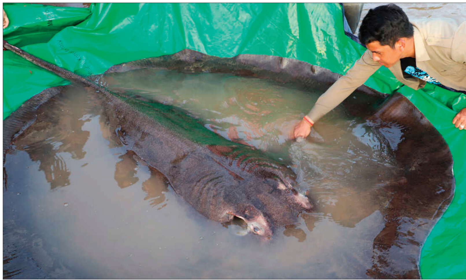
taken on June 14, 2022, a man touches a giant freshwater stingray before being released back into the Mekong River in the northeastern province of Stung Treng, Cambodia. A local fisherman caught the 661-pound stingray, which set the record for the world's largest known freshwater fish and earned him a $600 reward.

The stingray's catch was not just about setting a new record, he said.