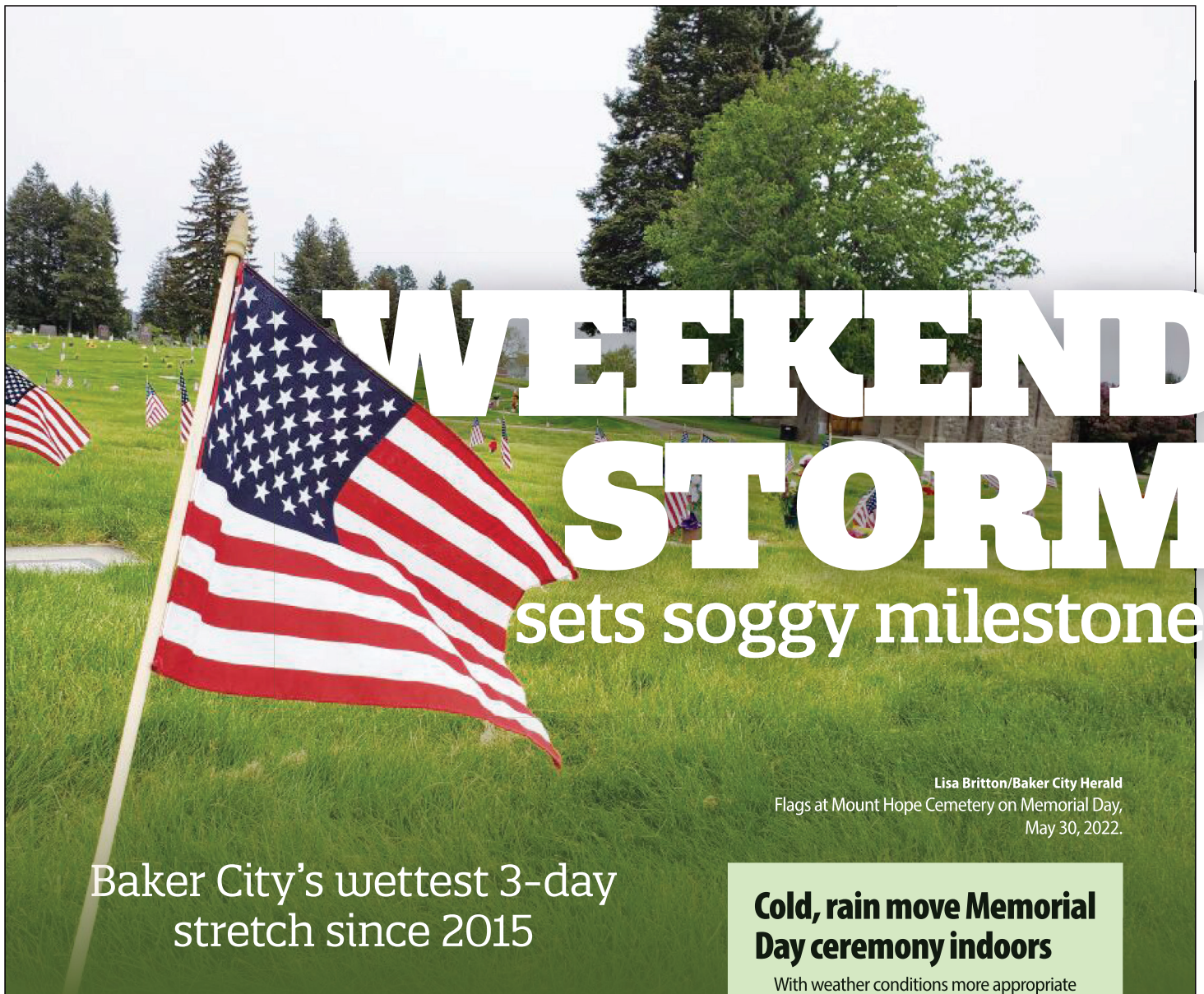
Flags at Mount Hope Cemetery on Memorial Day, May 30, 2022.

Full forecast on the back of the B section.