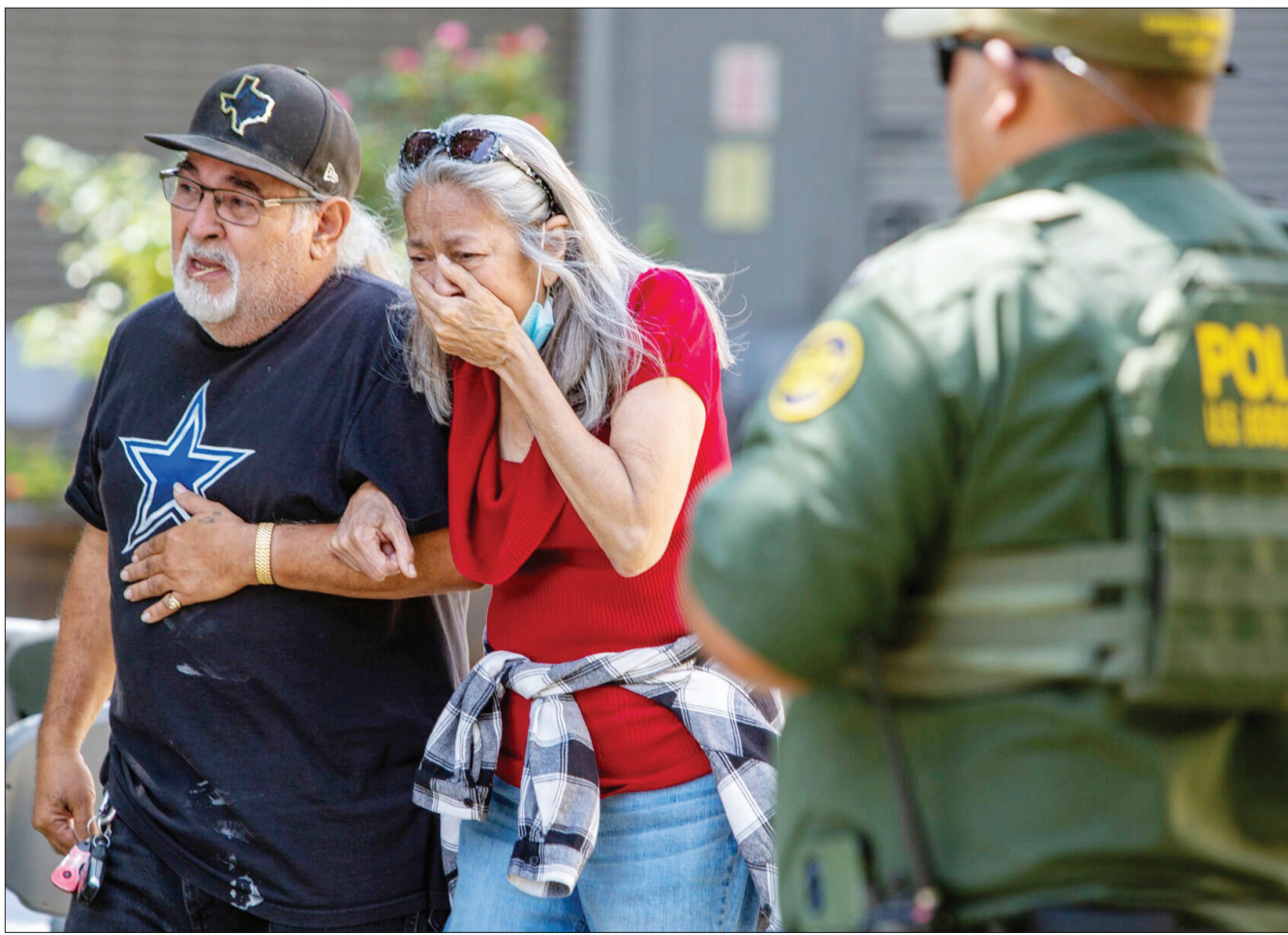
A woman cries as she leaves the Uvalde Civic Center on Tuesday, May 24, 2022, in Uvalde, Texas. An 18-year-old gunman opened fire at a Texas elementary school, killing multiple children and a teacher and wounding others, Gov. Greg Abbott said.