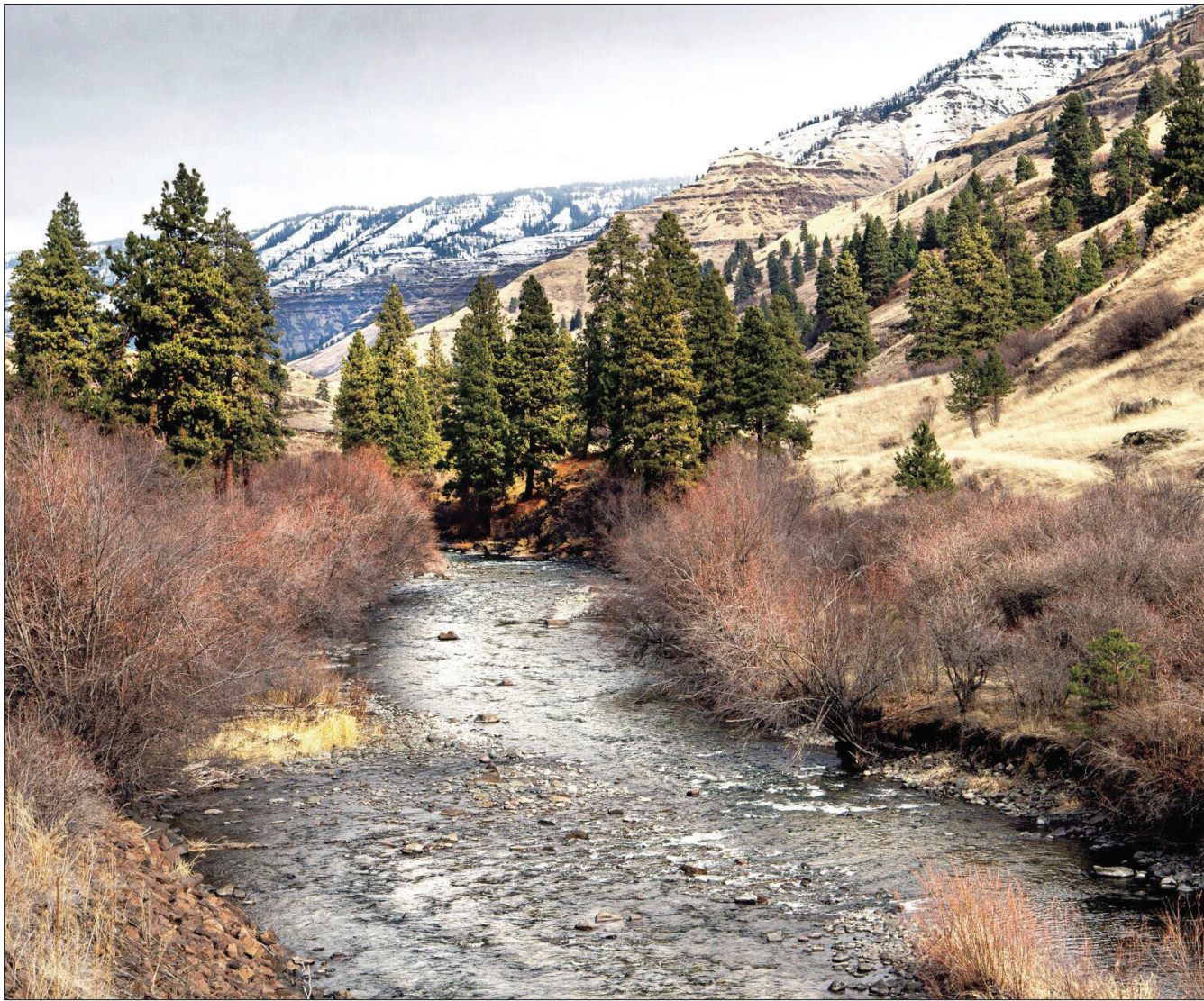
The Imnaha River winds through Wallowa County.

Anglers have been successful catching bass, and bass fishing will likely improve throughout the year as the water temperature increases.