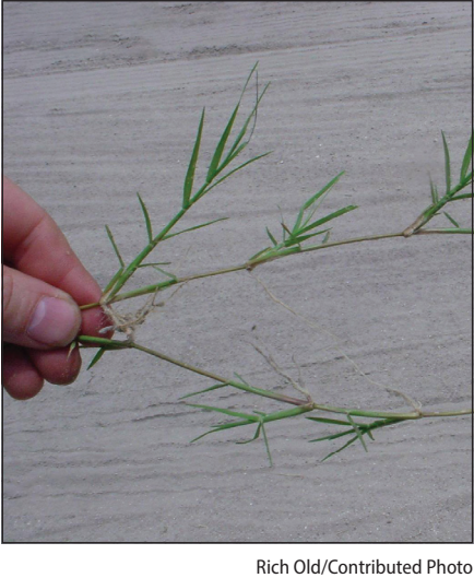
Bermudagrass can be an aggressive invader.

Bermudagrass normally spreads into areas as a contaminant on mowers, shoes and other fabrics. Once established it will slowly invade turf grass by its roots spreading underground and then sending its vegetative growth up. The plant looks great in the hot summer, but as soon as the fall frost hits, the plant the problem.