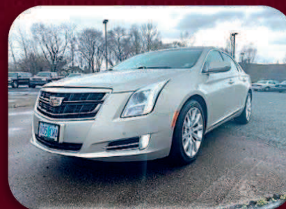
2016 Cadillac XTS $27,995