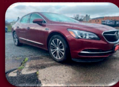
2017 Buck LaCrosse $28,995