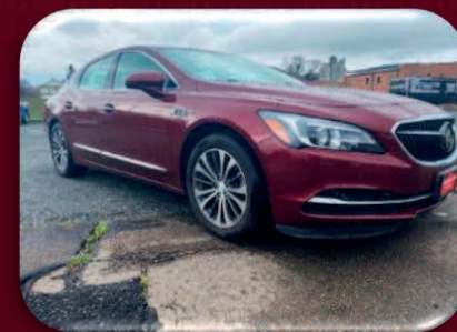
2017 Buck LaCrosse $28,995