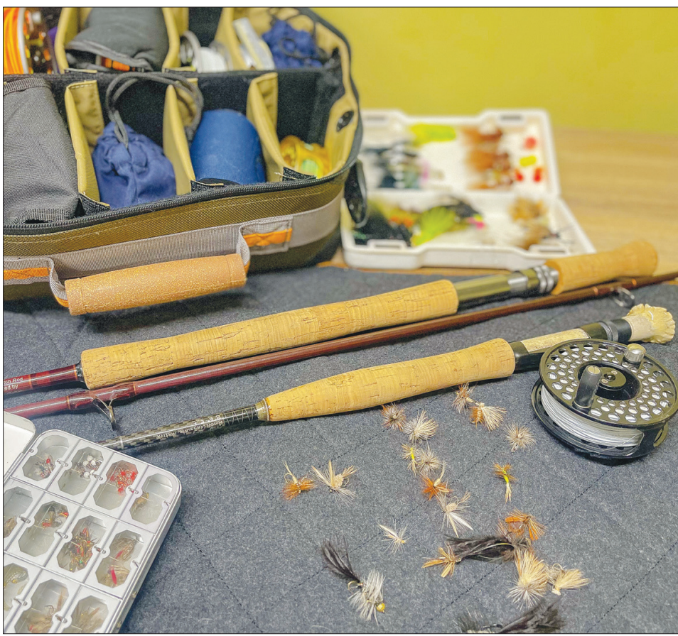
Rods, reels, nymphs, and streamers selected for a day on a desert lake.

Grabbing each bag and emptying its contents on the couch littered blue, green, and white foam boxes, gray plastic flip-sided boxes, giant "meat lockers" packed with blue, orange, and purple "intruders" capable of spooking a shark, and the one aluminum box of meticulously separated nymphs. At least the nymphs are kept with some order, but the lid of that box was stuffed with various dry fly patterns. Grabbing the nymph box and small foam box of streamers provided enough ammunition to be dangerous, so I moved on to the reel selection.