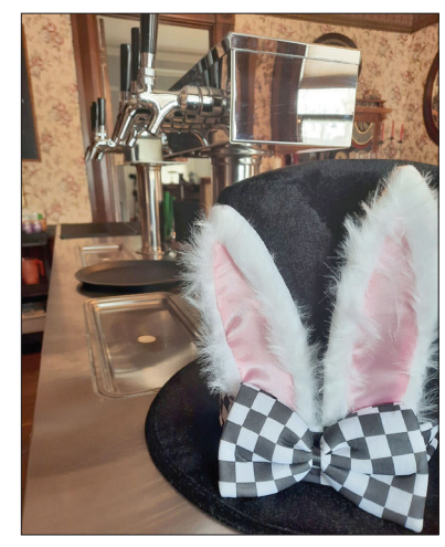
The next escape room theme at The Ison House is "Escape the White Rabbit." For details, visit www. theisonhouse.com.

"We did research to make it not too hard, and not too easy," she said. "It's fun to see people come out of the escape room they're laughing and ringing the bell."