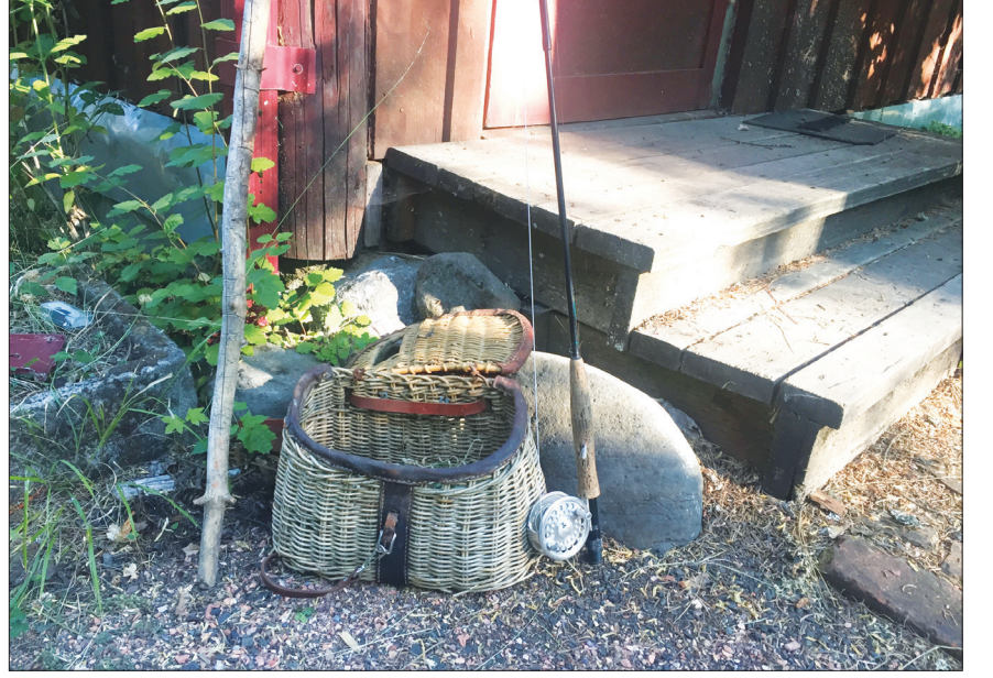
Grandpa Harry's restored fish box, wading stick, and fly rod are ready for action by the front

20 pounds (their largest, No. 7, was introduced in 1929 with a 40-pound capacity!). Since the horizontal weave or "weft" of Grandpa's creel is whole willow, not split, as were early versions built in the wickerwork or French weave style, it closely conforms to No. 14x in the wicker-weave series, first built by G.L. in 1941.