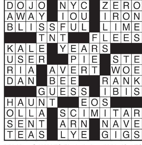
3-31-22